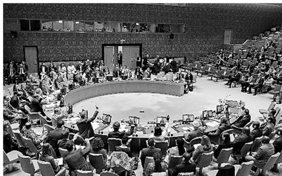
Figure 1 UNSC Vote on Resolution 2474 (2019)

The historic resolution stressed that parties in an armed conflict should collect, protect and manage data related to missing persons, recover and identify the dead, offering where possible their return to relatives. However, as in many past conflicts, these measures are not often taken. They are also difficult to enforce since they rely on compliance of actors with no interest in providing details many believe may incriminate them.